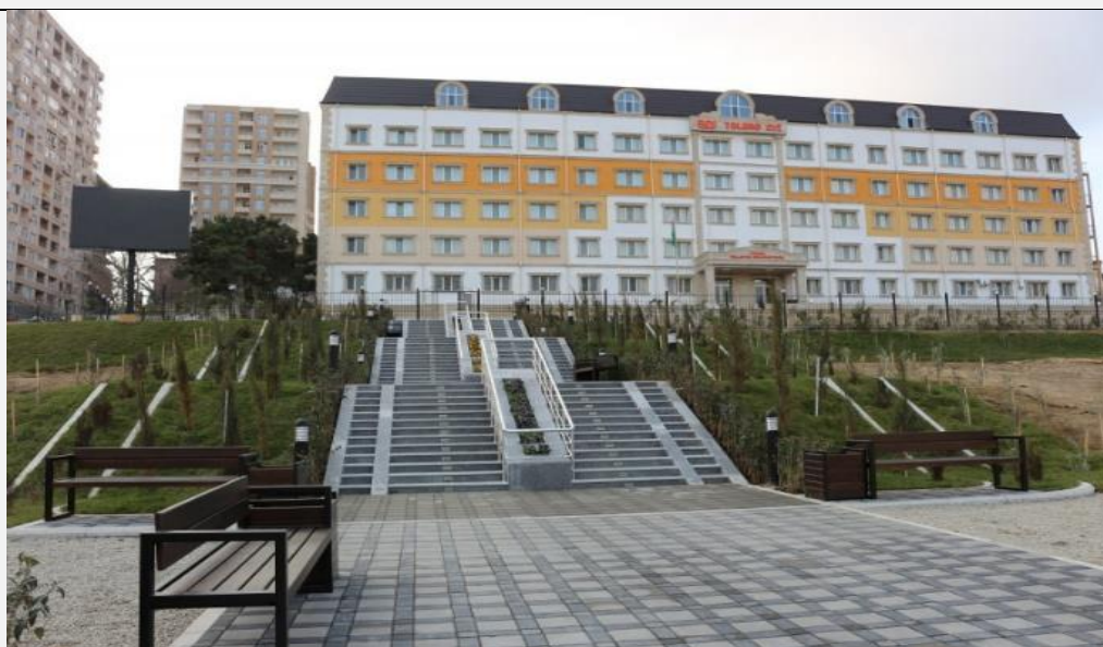
New five-story student's dormitory

Issued in: 20/12/2022. Revised in: 25/09/2023.