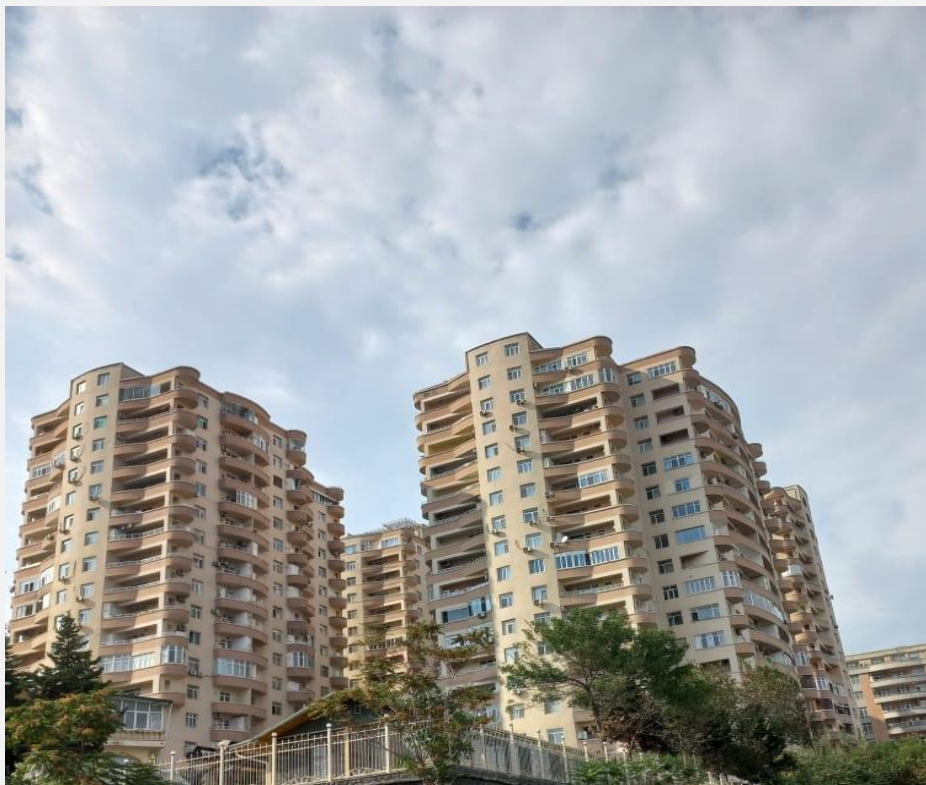
The living complexes “Kainat” and “Baku University”