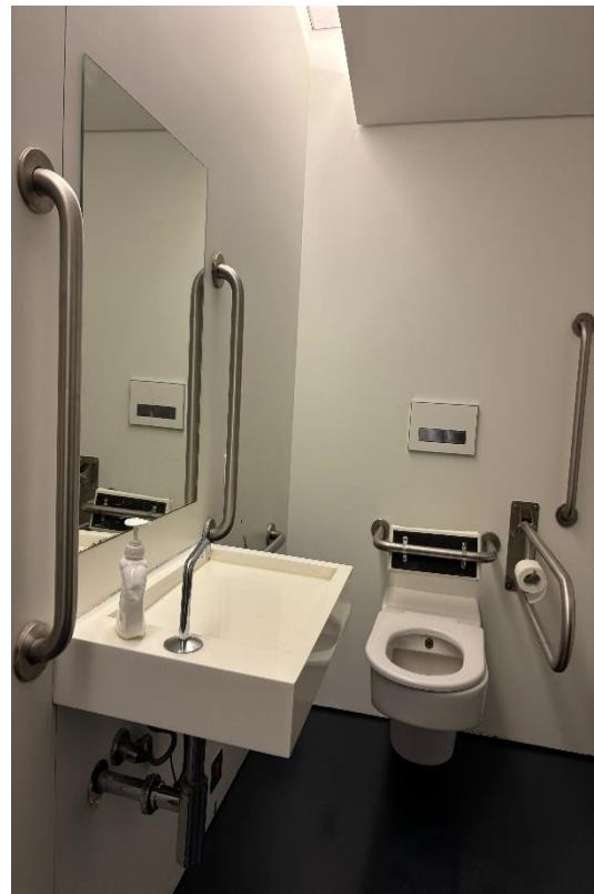
5. Accessible toilet