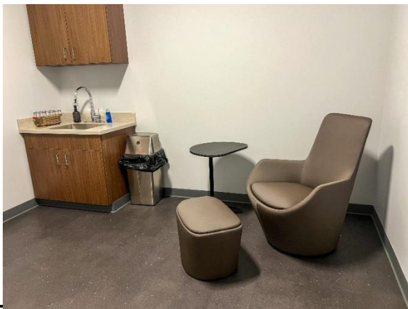
1. Lactation room