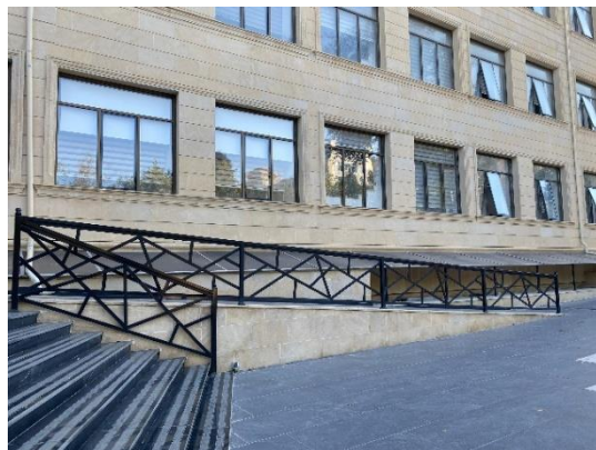
6. Accessibility ramp