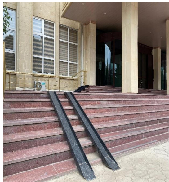
4. Wheelcahir ramps