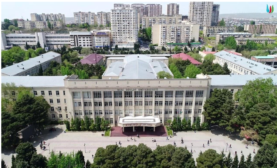
Baku State University -Main campus, Baku, Azerbaijan